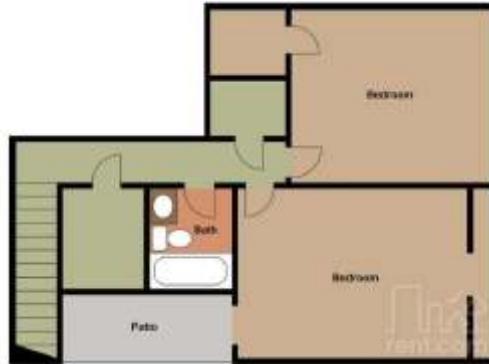
C2 3 BED/2 BATH -1,517 Sq. Ft.*