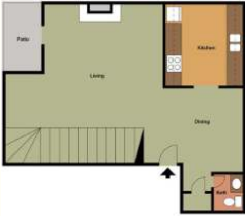
A9 1 BED/1 BATH -921 Sq. Ft.*