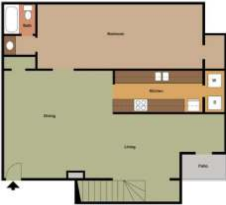
C1 3 BED/2 BATH -1,400 Sq. Ft.*